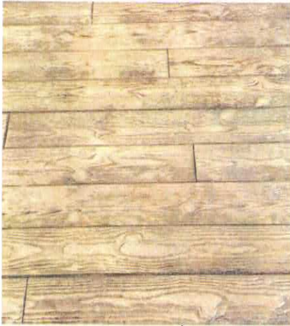
CLASSIC WOOLANK FM-8700