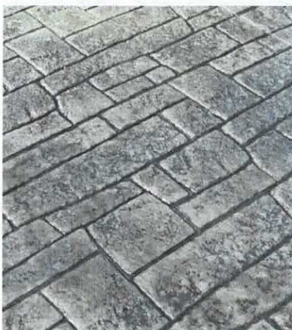
APPIAN COBBLE CS-400