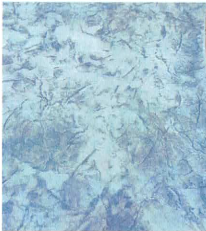
BRICKFORM ROMAN SLATE