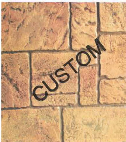
ENGLISH ASHLAR AS900