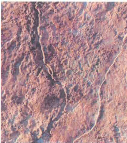
PROLINE OLD GRANITE