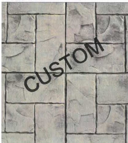
CALIFORNIA WEAVE FM-3500