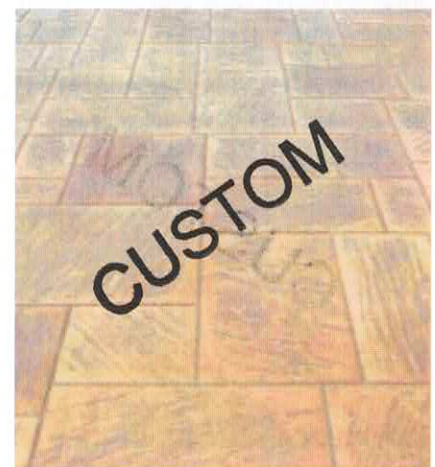
FRACTURED CYPRESS PD-800