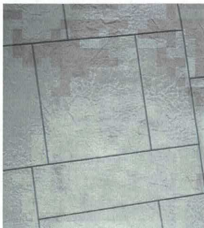
*ASPEN BLUESTONE MAGNETIC SMP-225