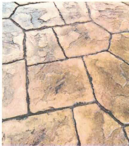
CASTLE STONE RS-180