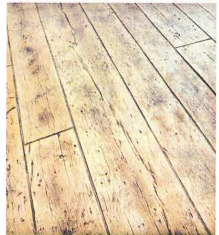
RECLAIMED TIMBER 8", 12", 16"