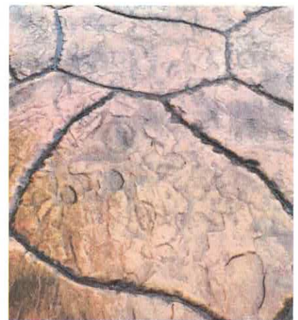
SANTA FE RANDOM STONE MEDIUM RS-700