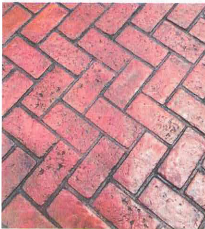
HERRINGBONE BRICK FM-5000