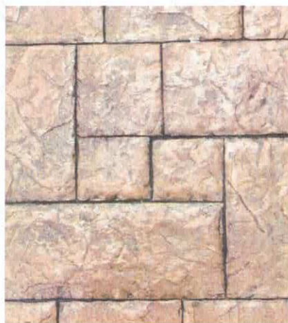
GRAND ASHLAR FM-3675