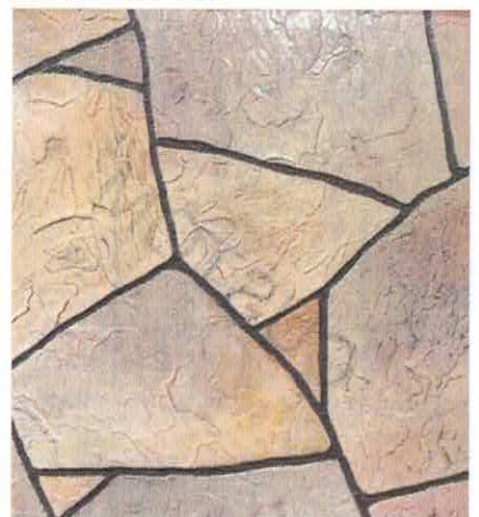
*SEDONA FLAGSTONE SMP-100 MAGNETIC

SAGINAW 5093 N.MICHIGAN | SAGINAW, MI 48604 | 989-792-9000