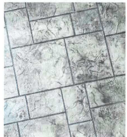
*MONTEREY ASHLAR MAGNETIC SMP-200

SAGINAW 5093 N.MICHIGAN | SAGINAW, MI 48604 | 989-792-9000