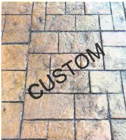
TUSCANY STONE FM-1775