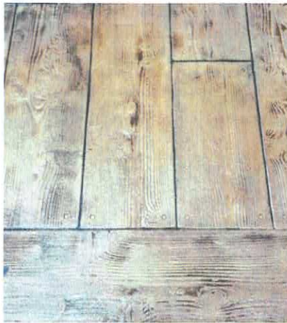
CEDAR WOOD PLANK FM-8010