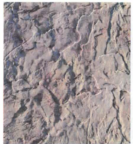
PROLINE ROMAN SLATE