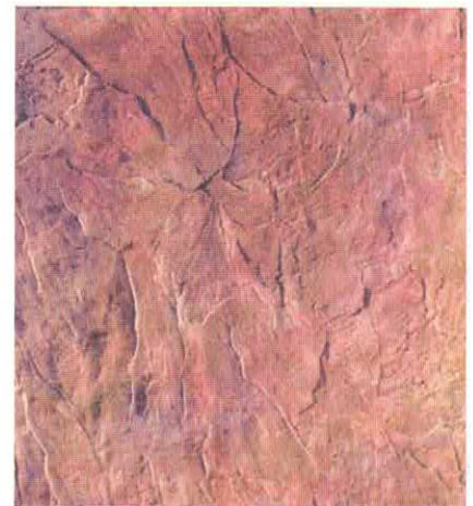
PROLINE ITALIAN SLATE