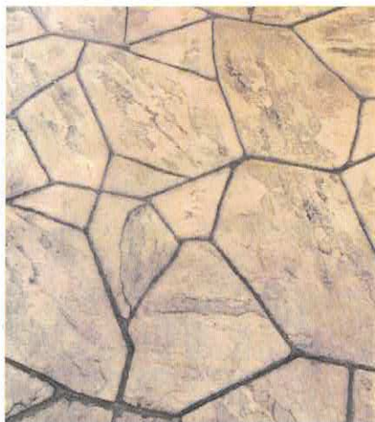
INCRETE FLAGSTONE FS1