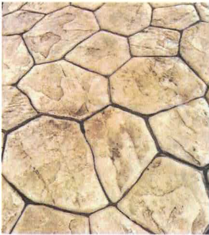
RANDOM STONE FM-700