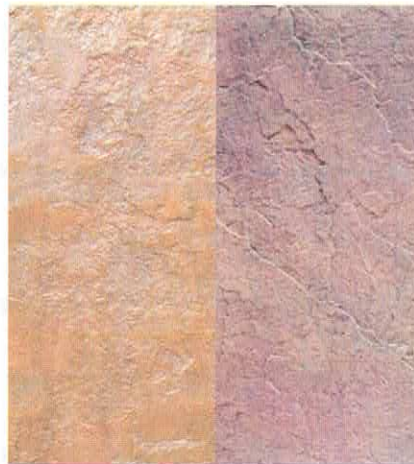
BRICKFORM SIERRA SEAMLESS PROLINE BELGIUM SLATE