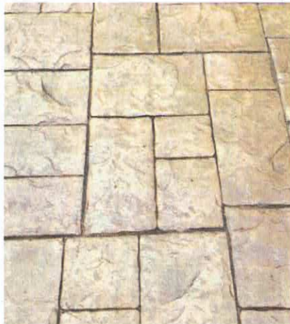
ASHLAR CUT SLATE FM-3125