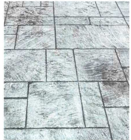
ROYAL ASHLAR M105