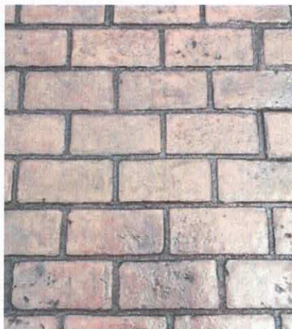
RUNNING BOND BRICK FM-5100