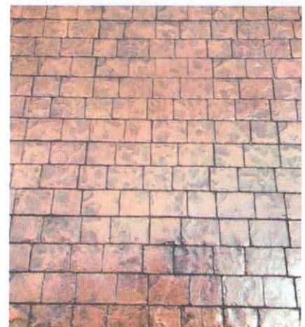
LONDON COBBLE FM-540