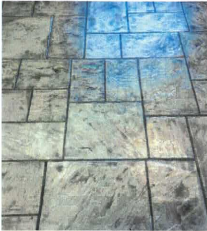
TM-100 ASHLAR TM-100