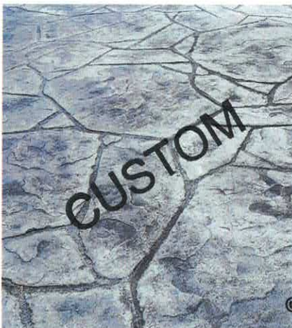
ARIZONA FLAGSTONE RS300