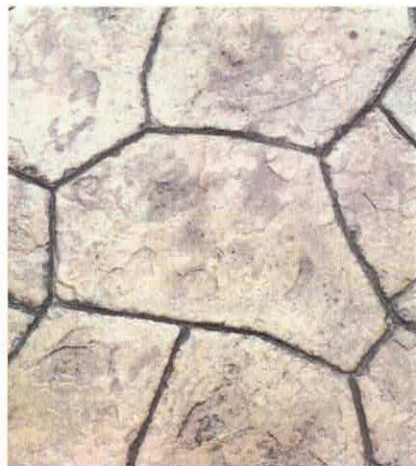
SANTA FE RANDOM STONE SMALL RS-600