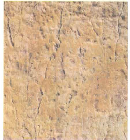
BRICKFORM SANDED SLATE